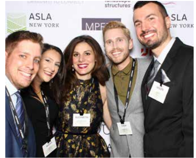
President's Dinner Photo Booth

Web: aslany.org Twitter: @ASLA_NY Instagram: asla_ny Facebook: https://www.facebook.com/ASLANY1914 Youtube: https://www.youtube.com/user/ASLANewYork