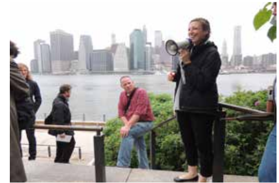
Brooklyn Bridge Park Tour