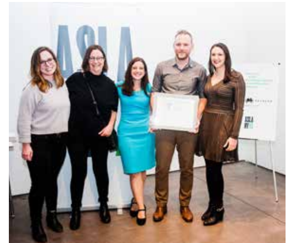
2017 Design Awards Ceremony