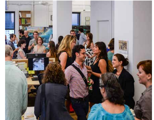
Open Studio at SCAPE