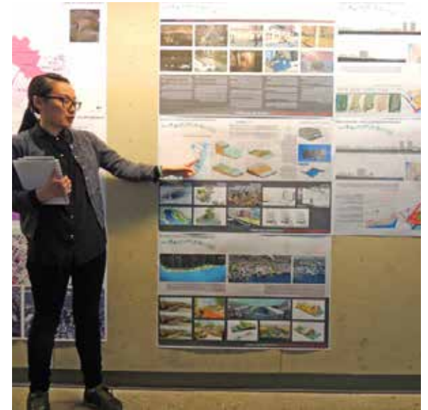
CCNY Student Thesis Project Review