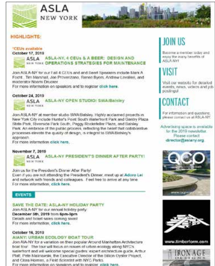
ASLA-NY E|News Newsletter