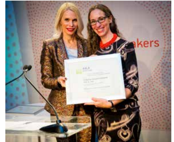
2018 President's Dinner