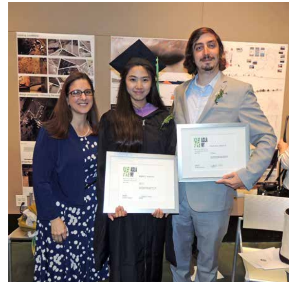
2015 CCNY Student Design Award Winners