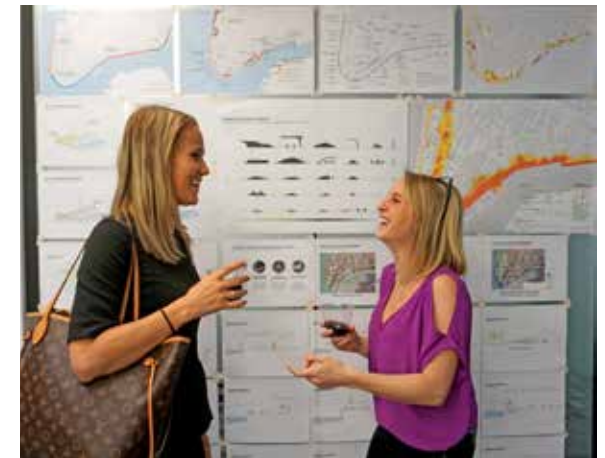
Open Studio at AECOM