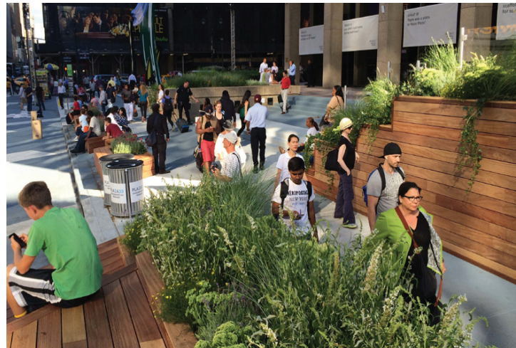
Plaza 33 by W Architecture and Landscape Architecture. The jury highlights the project’s temporary, yet “subtle intervention intended to subvert eternal autocentrism.” Credit: W Architecture and Landscape Architecture.

represented by this year’s award recipients is very inspiring as these projects will bring joy to those visiting these landscapes and awareness to our profession. I am thankful to the landscape architects who continue to work tirelessly creating such beautiful works of art.”