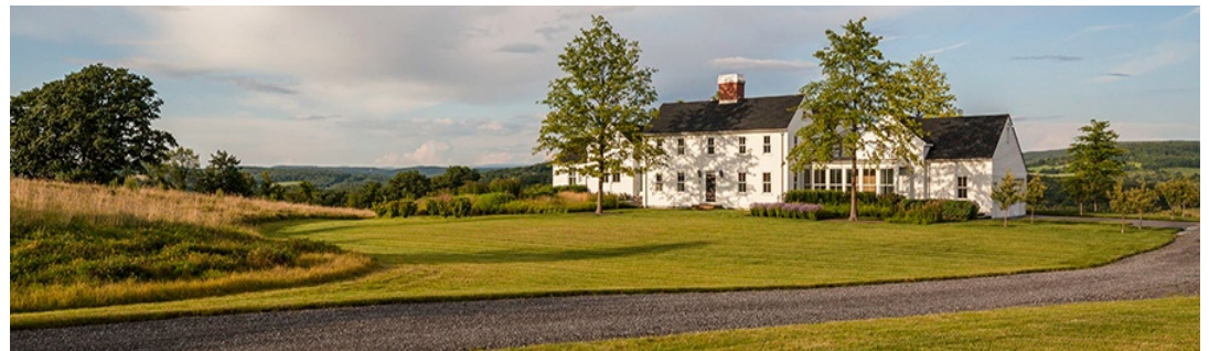
Columbia Farm by LeBlanc Jones Landscape Architects. The jury highlights the project’s sensitive integration into the surrounding landscape.

The winning projects included two Honor Awards in General Design, two in Analysis/Planning/Research and Communications and four in Residential Design.